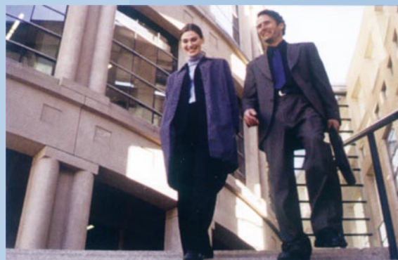
AISMM Headquarters – Lindfield, Sydney

Delivered direct to your door, an opportunity to discover new ideas, gain knowledge or gather information and tips on current and future trends. Stay in touch with the exciting world of sales, marketing and management.